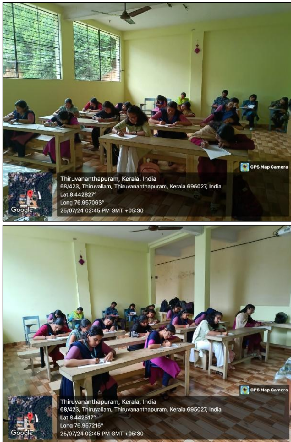
Fig. 2 - Students participating in Intracollegiate Letter Writing Competition

The competition was conducted on 25 th July at 02:30 pm, and drew the enthusiastic participation of student teachers from the first year and second year of various Departments such as English, Malayalam, Commerce, Social Science and Mathematics, showcasing their imaginative and scientific perspectives. A total of 17 students participated. Letters ranged from poetic tributes to the Moon's beauty to the futuristic visions of Lunar explorations expressed in both English and Malayalam.